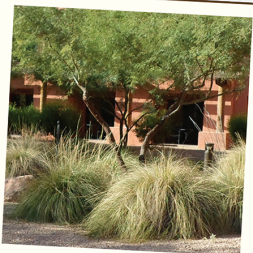
TREES & SHRUBS