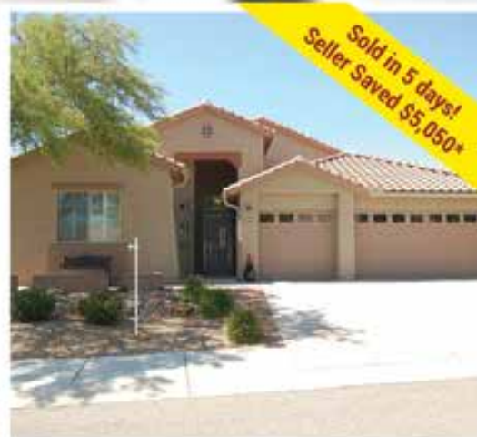
7848 N Rondure Loop

Sold in 6 days and Seller Saved $6,792* in commissions!