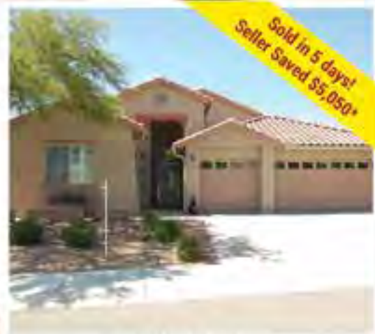
7848 N Rondure Loop

Sold in 6 days and Seller Saved $6,792* in commissions!