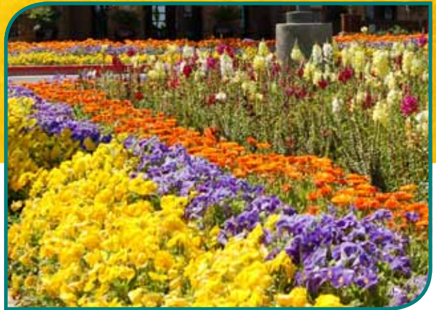
Yellow & Purple Pansies, Calendulas and SnapDragons

When your soil is ready, you can contemplate which varieties of flowers you want to plant. Calendulas, Geraniums, Pansies and Petunias are some good choices that grow well in winter in the low desert, but there are many others as well. Sweet Alyssum and Lobelia are best for borders around the edge of your flower beds. At the nursery, select the healthiest plants you can find. Younger plants are generally a better choice than tall, leggy plants that have already spent