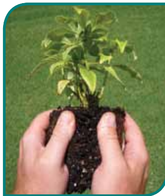
Opening the root ball helps the plant establish itself after transplanting

a long time in the container. Naturally, you should choose flowers that are suited to the sunlight available at the location of your flower bed (full sun, partial sun, constant shade).