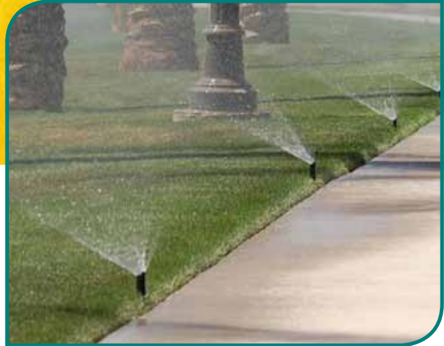
Make sure all nozzles are pointing in the right direction to ensure the intended area is being sprayed

3. Once you have checked that the water delivery system is