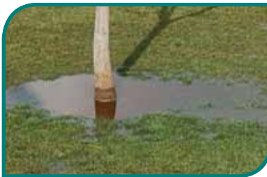
Take advantage of rainfall. Turn irrigation clocks off and monitor soil moisture and plant condition to determine when more water is needed

4. Finally, do a reality check. You want to make sure moisture from your irrigation system is actually reaching the root zone of your plants. To test the depth the water is reaching, use a long screwdriver, piece of rebar or purchase a soil probe. A screwdriver will move easily through most soil when it is wet, but will stop when it reaches dry soil. The roots of most shrubs are not more than 6" to 18" deep and even a large tree will have most of its roots within the first 24" of soil. For turf, getting moisture to a depth of 6" should be sufficient.