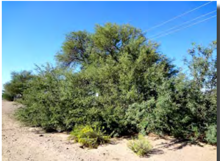
Overgrown and untrimmed areas before