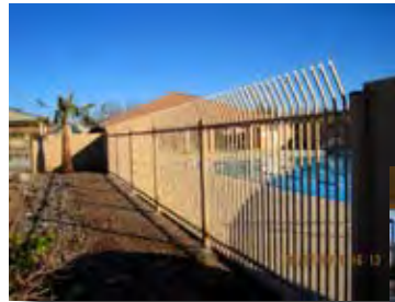
New fencing & pool deck

Wrought iron fencing replaced at both pools Advisory signs replaced at both pools Windmill Pool deck resurfaced and repaired Community Center pool heater #3 Community Center sand filter media replaced Annual pool furniture replaced