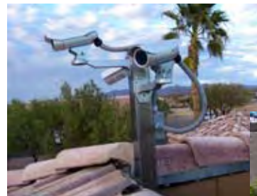
Windmill Park's new cameras and basin maintenance

Windmill Park parking lot repaved Community Center HVAC system replaced Association archived files digitally scanned CRCA website re-hosted Windmill Park security cameras upgraded Windmill Park basins serviced Windmill Office remodeled for lobby expansion Community Center chairs replaced Common area wall repaired near Sonesta Drive Community Center Flagpole installed Phobos Tot Lot asphalt resealed