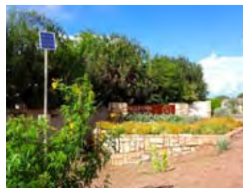
Parcel entryways refurbished

Twin Peaks CRCA monument plants & turf Concrete edging of turf at CRCA main monument Large tree annual service for common areas Semi-annual fertilizations of flowering shrubs Decorative granite replenishments throughout CRCA Twin Peaks roadside plantings Refurbishment of parcel entryways throughout CRCA Restoration of annual flower planter beds Windmill Park fields re-leveling & concrete edging Miscellaneous dead plant & tree replacements Common Area rodent extermination program