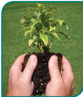
Opening the root ball helps the plant establish itself after transplanting

a long time in the container. Naturally, you should choose flowers that are suited to the sunlight available at the location of your flower bed (full sun, partial sun, constant shade).