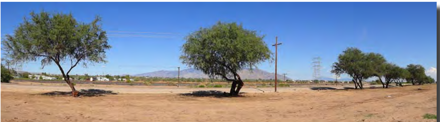
Area after trimming and clean-up