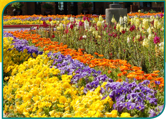
Yellow & Purple Pansies, Calendulas and SnapDragons

When your soil is ready, you can contemplate which varieties of flowers you want to plant. Calendulas, Geraniums, Pansies and Petunias are some good choices that grow well in winter in the low desert, but there are many others as well. Sweet Alyssum and Lobelia are best for borders around the edge of your flower beds. At the nursery, select the healthiest plants you can find. Younger plants are generally a better choice than tall, leggy plants that have already spent