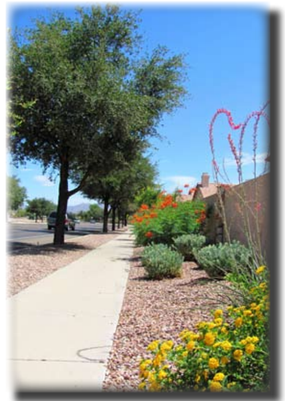
Coachline Blvd. Oak Trees

Many Marana and Tucson natives will tell you that they identify Continental Ranch with its groves of Oak Trees along Coachline Blvd, stretching from Silverbell Road to Twin Peaks Road. The Landscape Committee feels that these 20+ year old Oak Trees are a valuable asset to Continental Ranch. During the last year or so, the health of these trees appeared to decline. As the heat of summer crept in, the trees continued to look increasingly more stressed. In response, at the request of the Committee, arborists from the University of Arizona inspected the site and recommended refurbishing the drip irrigation system. Over time many of the drip emitters became buried in the soil and clogged or were pinched off by root growth. The Board of Directors authorized DLC Resources to add new emitters to the existing lines, followed by a deep root watering to help hydrate and rejuvenate the trees. This work was completed last month, and the trees have begun to improve considerably. The Landscape Committee will continue to monitor these trees to ensure that the Association protects the health of one of its beautiful and defining features – The Oaks!