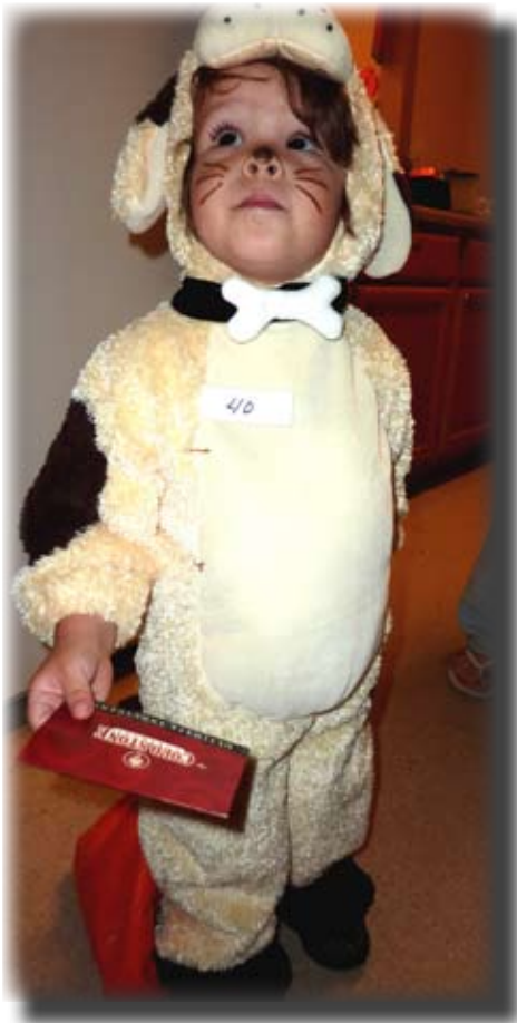
Continental Ranch Resident