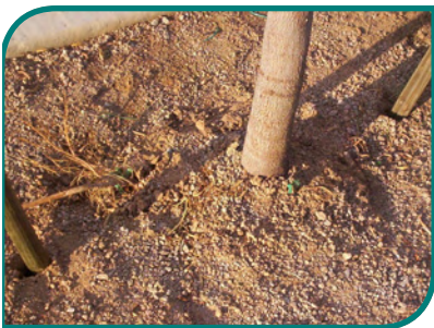
Root bound trees can usually be identified by observing the soil when gently shaking the tree. If the ground around the base of the tree moves, chances are the tree is root bound.

In locations where trees are removed, replacement trees are selected to include the best quality given the availability and variety. Depending on these factors, some replacement trees will be 15 gallon, 24" or 36" box size. It is important to note that where smaller trees are chosen, they will grow stronger in time because they have more growth time in their new location.